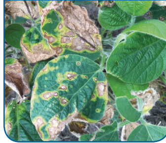
Glutamine Synthesis Inhibitor (10) Glufosinate, Liberty, etc.