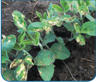
Photosynthesis II Inhibitor (5,6 & 7) Atrazine, Basagran, Buctril, etc.