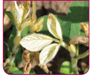
Grasses and/or broadleaves affected HPPD Inhibitor (27) Callisto, Impact, Laudis, etc.