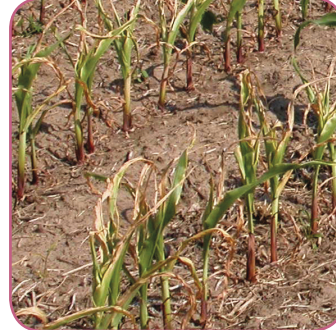
Nonselective EPSP Synthase Inhibitor (9) Glyphosate, Roundup, etc.