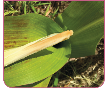
Only grasses affected ACCase Inhibitor (1) Assure, Poast, Select, etc.