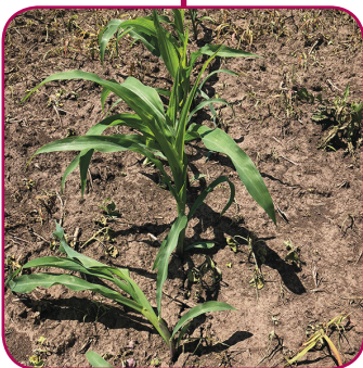
Broadleaves more sensitive than grasses Synthetic Auxin (4) 2,4-D, Dicamba, Status, Stinger, etc.

New leaves chlorotic/reddish, plants stunted