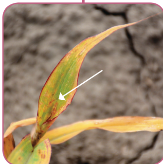
Grasses and/or broadleaves affected ALS Inhibitor (2) Accent, Classic, Harmony, Resolve, Pursuit, etc.

Variable injury, chlorosis, purpling, necrosis