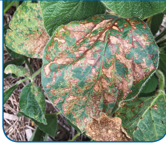
PPO Inhibitor (14) Aim, Cobra, Flexstar, etc.