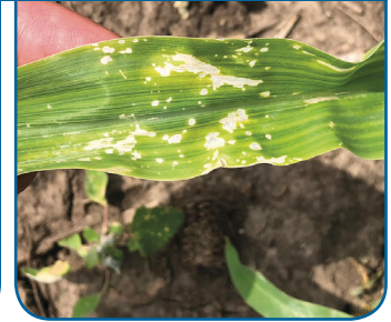
Photosystem I Electron Diverter (22) Diquat, Gramoxone, etc.